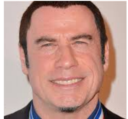
John Travolta's not good enough?

Travolta had great success with the television series Welcome Back, Kotter and starring in the box office successes Saturday Night Fever and Grease . His career enjoyed a resurgence in the 1990s with his role in Pulp Fiction , and he has continued starring in more films such as Face/Off , Ladder 49 , and Wild Hogs . Travolta was nominated for the Academy Award for Best Actor for Saturday Night Fever and Pulp Fiction . He won the Golden Globe Award for Best Actor - Motion Picture Musical or Comedy for his performance in Get Shorty . SOURCE: Wikipedia.org