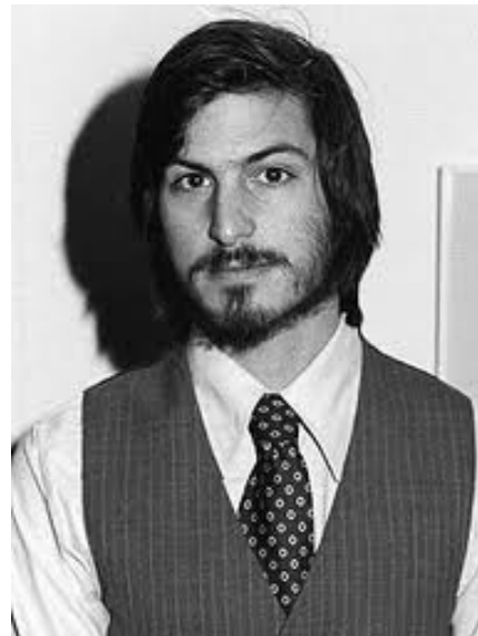
Steve Jobs was not good enough? Seriously?