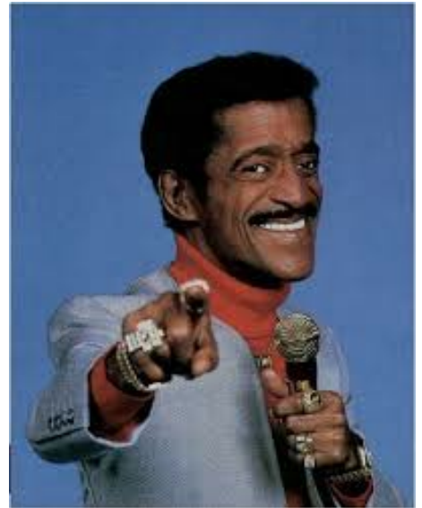
Sammy Davis, Jr. was not good enough?

Singer, tap dancer, actor (stage, television, motion pictures), and musician Davis was awarded the Spingarn Medal by the NAACP and was nominated for a Golden Globe and an Emmy Award for his television performances. He was the recipient of the Kennedy Center Honors in 1987; and in 2001, he was posthumously awarded the Grammy Lifetime Achievement Award. SOURCE: Wikipedia.org