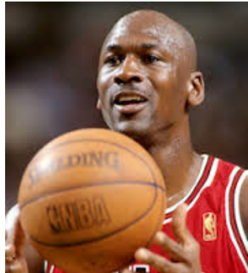
Michael Jordan was not good enough?