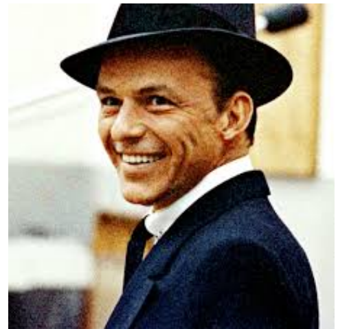
Frank Sinatra was not good enough?