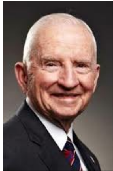
Ross Perot was not good enough? Really?