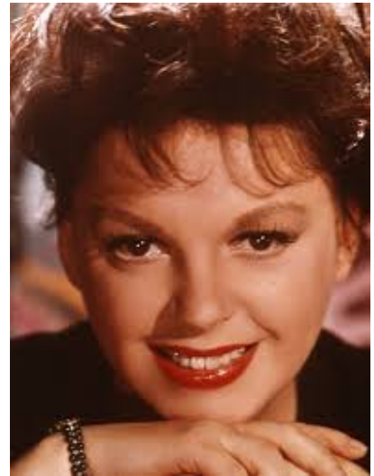
Judy Garland's not good enough?

Garland won or was nominated for awards for her work in motion pictures, television, music recording and on stage. She was twice nominated for an Academy Award and was awarded a special Academy Juvenile Award in 1940. Garland won a Golden Globe Award and was nominated for a second, and she received a special Tony Award for her record-breaking concert run at New York's Palace Theatre. Garland won two Grammy Awards for her concert album Hall . Garland was posthumously awarded a Grammy Lifetime Achievement Award. Several of her recordings have been inducted into the Grammy Hall of Fame. In 1999, the American Film Institute placed her among the ten greatest female stars in the history of American cinema. SOURCE: Wikipedia.org