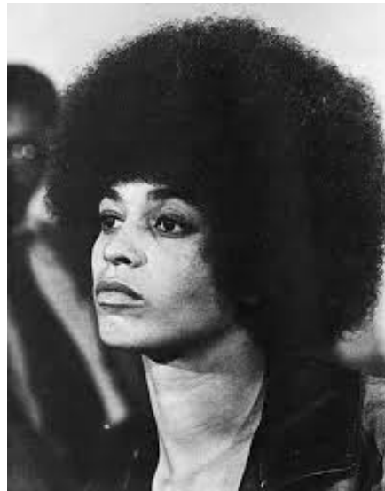
Angela Davis was not good enough?

What if YOU WERE GOOD ENOUGH , but your ideas went against the grain?