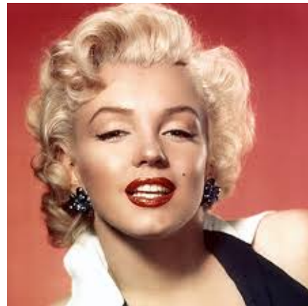
Marilyn Monroe was "too beautiful" to be considered a "smart" actress and was categorized as not good enough?

That's not a dumb actress in "Niagara," but a smart one!