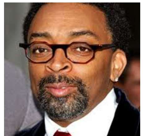
Spike Lee's not good enough?

Do the Right Thing 4 Little Girls He Got Game Malcolm X Get On The Bus Bamboozled Inside Man Miracle at St. Anna