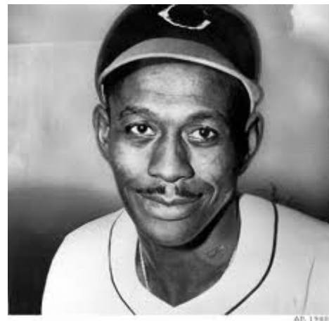
Leroy Robert “Satchel” Paige and all of Negro baseball were not good enough?